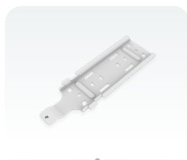
Outdoor case bracket